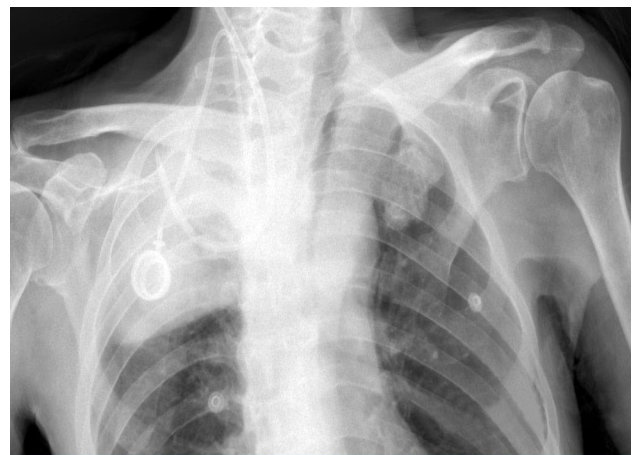
Figure 1. Chest radiograph demonstrating interposition of the right dialysis catheter.

to ensure thorough exploration. However, due to the patient's poor general condition and the high surgical risk, the decision was made to proceed with angiography and endovascular intervention instead. The patient was transferred to the angiography laboratory, where, following sterile draping and administration of local anesthesia, a sheath was inserted into the left femoral artery through a puncture guided by ultrasonography. A 0.035-inch hydrophilic wire was introduced through the vertebral catheter, followed by control imaging. Finally, a pigtail catheter was placed to complete the procedure. The catheter in the right jugular vein was withdrawn and an 8×60 mm Cover Wall