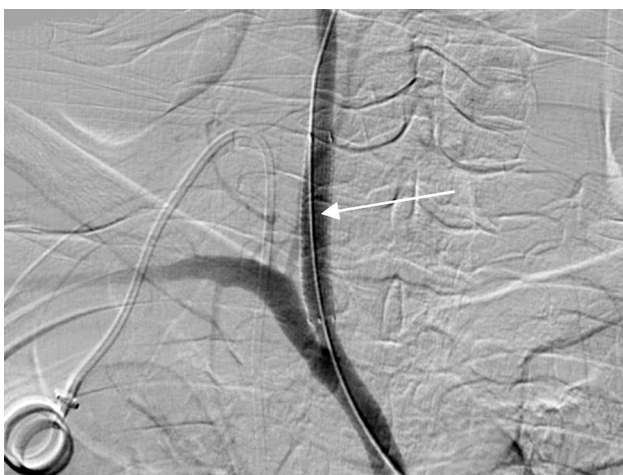
Figure 4. Cover Wall stent placement in the proximal part of the right carotid artery.

stent (Carotid Wallstent Monorail Endoprosthesis, 8×38 mm; Boston Scientific, Marlborough, MA, USA) was placed in the proximal segment of the right common carotid artery. Control imaging was performed and no extravasation was observed. The procedure was terminated without complications (Figure 4). The patient had an uneventful postoperative course and was discharged in good general condition after a week of follow-up.