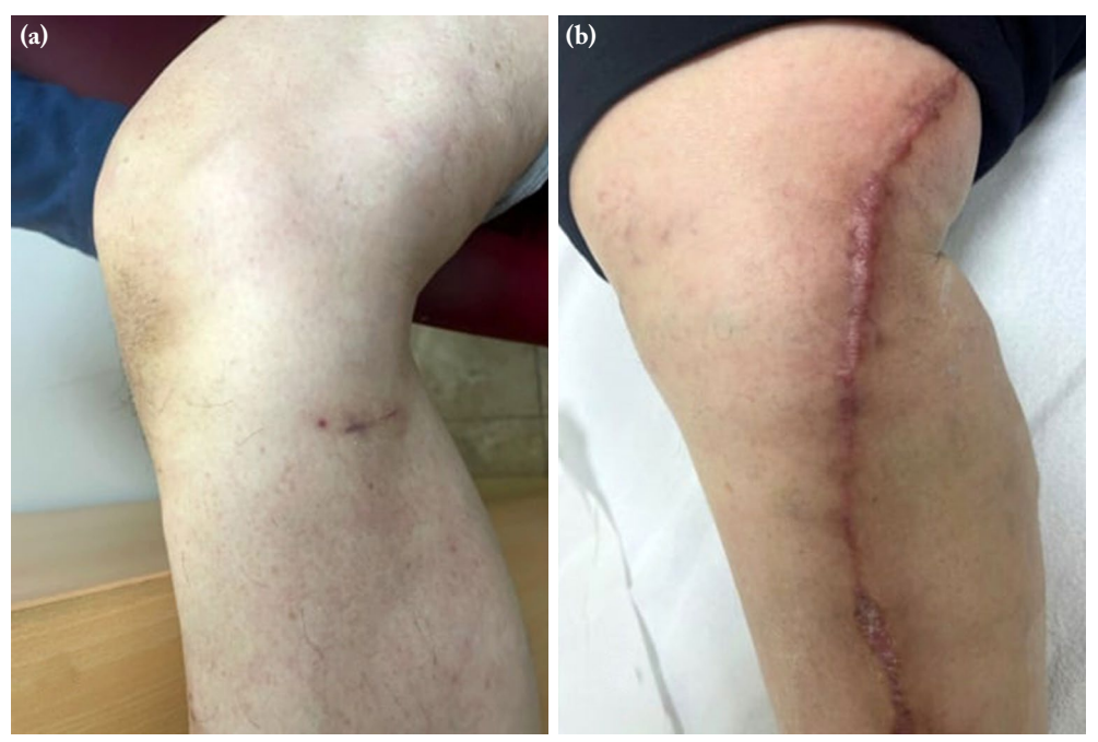
Figure 1. (a) Healed distal incision of a patient in the EVH group. (b) Healed incision of a patient in the open group. EVH: Endoscopic vein harvesting.