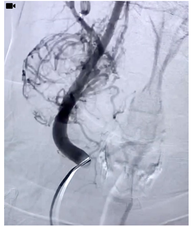
Video 2. Angiographic imaging of the vessels feeding the tumor.