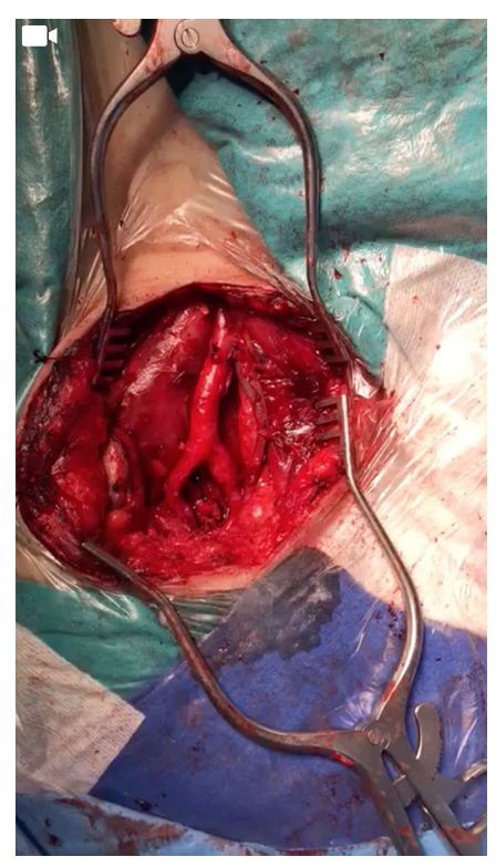
Video 4. Tumor totally excised carotid arteries.